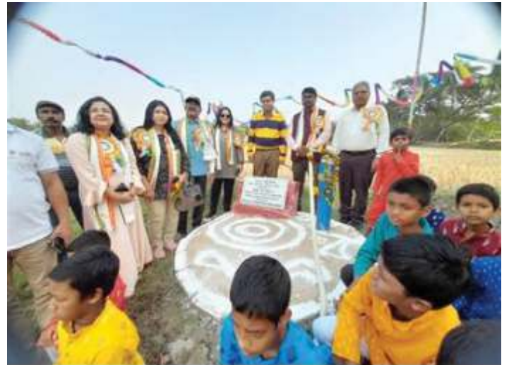
Inauguration of Deep Tubewell under Mega Economic Development Program on 28th January, 2023