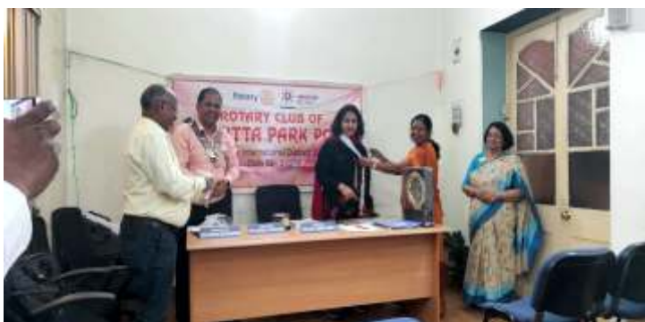
AG & ZS Visit in Our Club