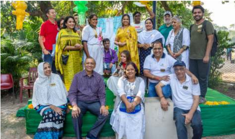
Team Rotary Club of Calcutta Park Point 2022-23

WE WELCOME OUR DISTRICT GOVERNOR VISIT TO ROTARY CLUB OF PARK POINT VENUE : OUTRAM CLUB ON 24/02/2023 QUATERLY BULLETIN FOR THE PERIOD (JANUARY - FEBRUARY 2022)