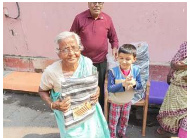
Distribution of 120 Blankets to Old & Aged People