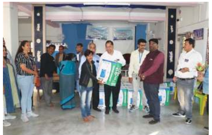
Distribution of 75 Battery operated Knapsack sprayer Machine