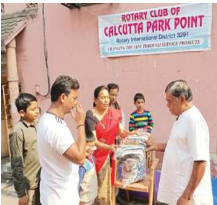
Kids Blanket Distribution Project