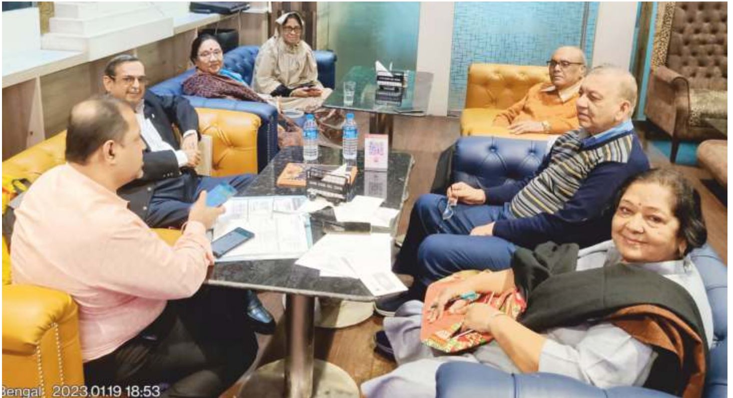
Regular Club Meeting at Saffron, Ballygunge