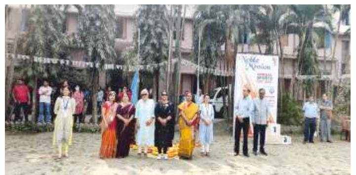
Participated at Annual Sports Meet of Noble Mission