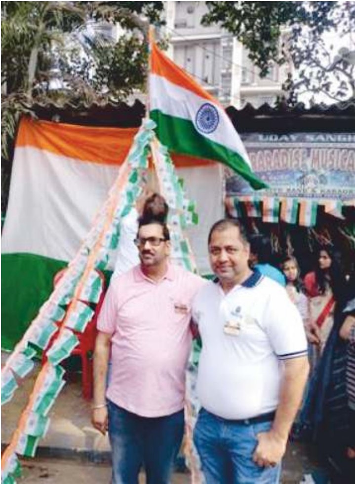
Celebratin of Republic Day at Christopher Road